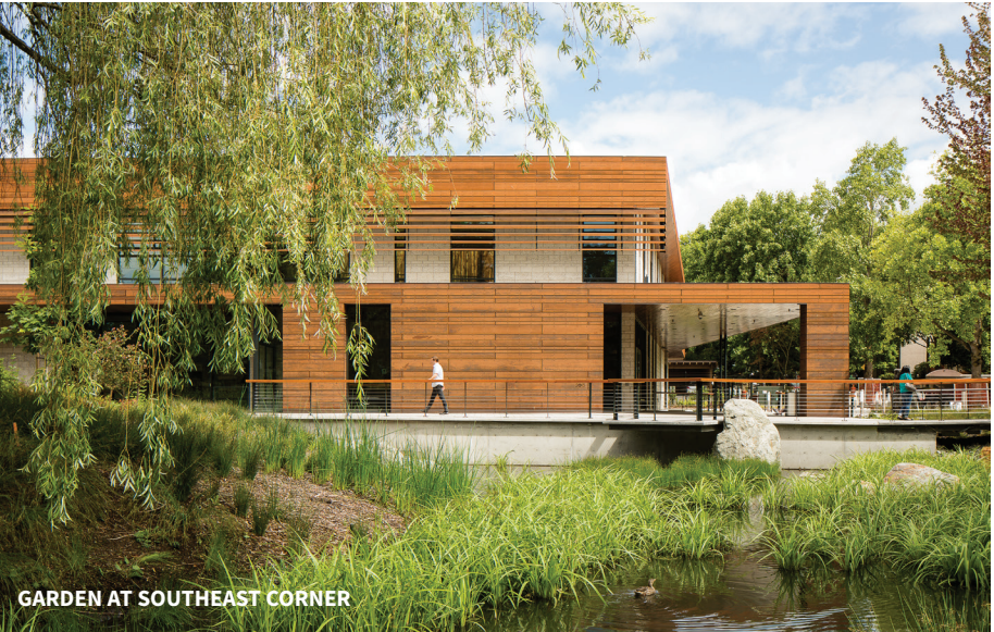
GARDEN AT SOUTHEAST CORNER