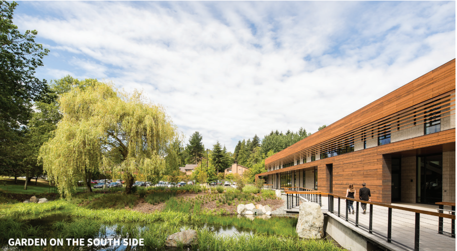
GARDEN ON THE SOUTH SIDE

Partially funded by a federal grant, the Meridian Center for Health is a first of its kind: an integrated, one-stop model for health treatment and prevention for underserved Seattle-area residents. Uniting three health organizations under the same roof, the center provides low- to no-cost medical, dental, and mental health services for adults and children. Design elements include an open floor plan, a dramatic feature stair in the lobby, and a range of team and community spaces that remain available for neighborhood organizations after hours. The Center is tracking to receive LEED Gold certification.