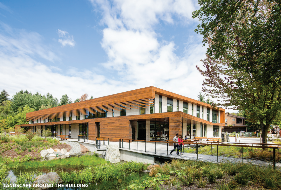
LANDSCAPE AROUND THE BUILDING