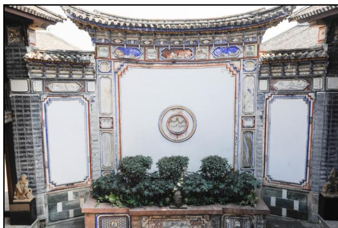
A typical Bai house is built with three buildings forming a U shape and a fourth wall used as a screen wall, which is used to reflect light into the rooms. Linden Centre.

Throughout China and in the small towns and villages of Yunnan province there has been a tremendous building boom, in which farming houses built of local materials through labor exchanges are being replaced with larger homes oriented toward consumption and private space. This transformation reflects various trends associated with economic development – increased cash flows from outbound migrant labor, availability of new materials such as concrete and glass windows, the advent of running water and flush toilets, and the declining importance of traditional agriculture. With the rapid increase of wage labor and the rising tourist economy, how can new homes support sustainable livelihoods in the region? How can traditional architecture and folkways negotiate the sweeping changes brought by rapid modernization? The distinct regional and ethnic identities of communities in Yunnan province offer case studies that engage these crucial questions of sustainability in China.