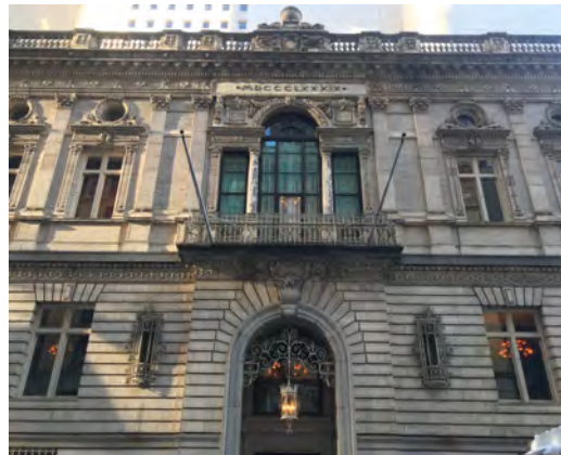
Above: Century Association, New York.

About 120 design industry leaders attend the event. E-mail blast regarding the event reaches all (12,000) COD members. Announcements of the event go out on COD social media sites: Facebook, Twitter and Wordpress blog. Event announcement stays on COD website.