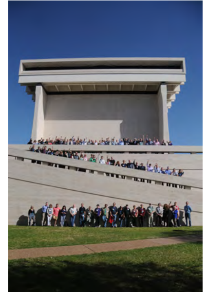
Committee on Design members at conference in Austin, Texas in February, 2017.