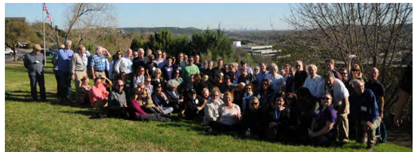
Committee on Design Members in Austin, Texas in February, 2017.