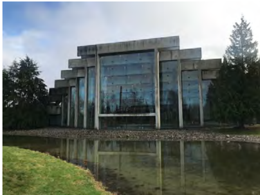
Above: Museum of Anthropology, Vancouver BC.

The tours will be led by architects familiar with the design aspirations with each building. The conference will also include presentations by planners involved with the developments. Join COD for what is shaping up to be an exceptional conference in one of the great North American cities!