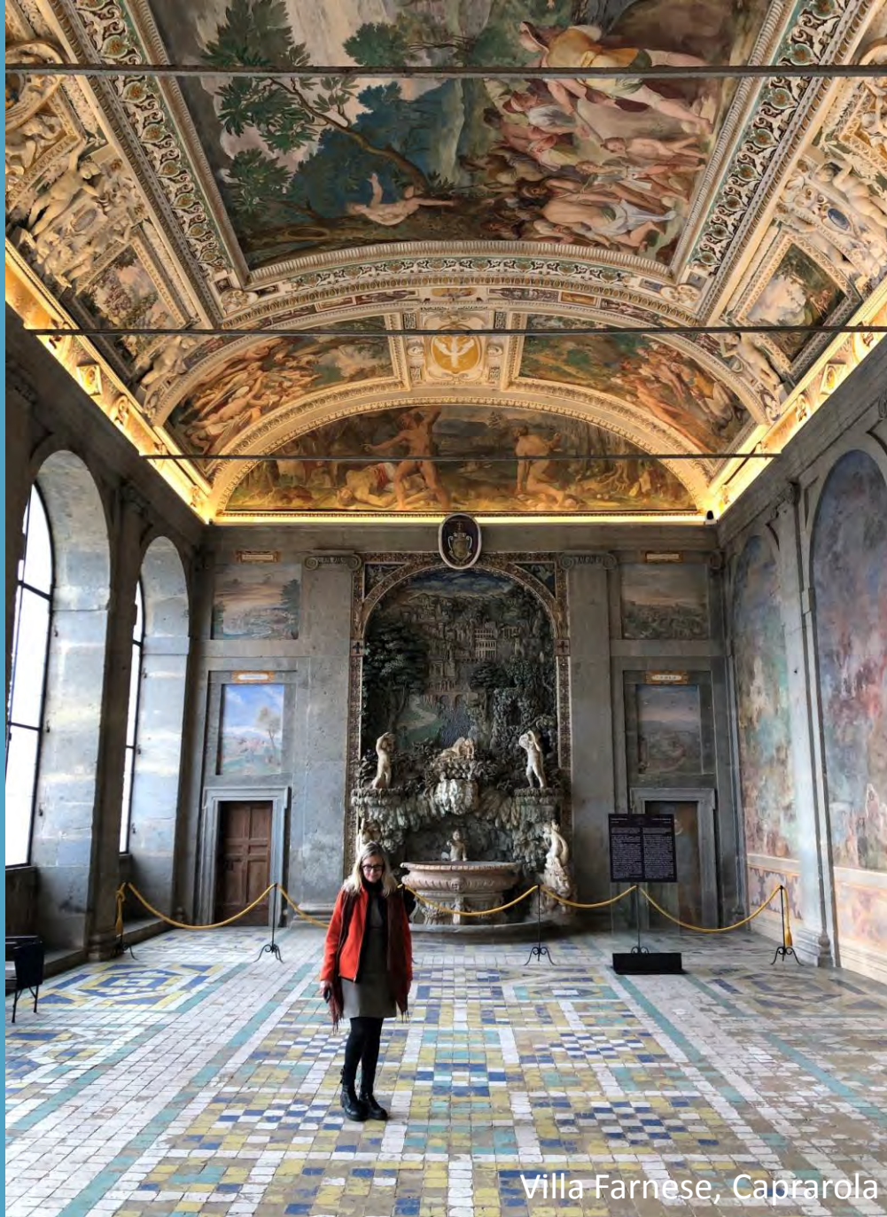
Villa Farnese, Caprarola