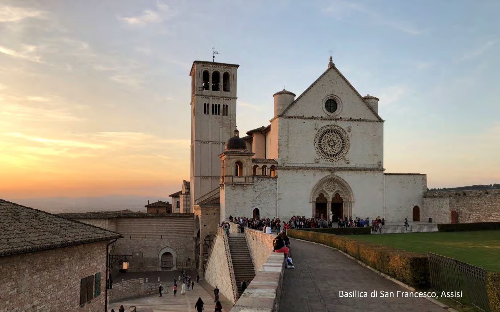
Basilica di San Francesco, Assisi