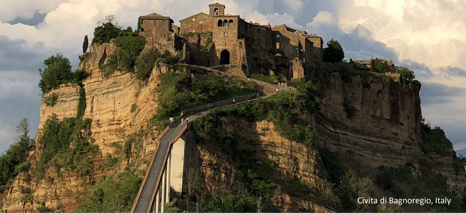
Civita di Bagnoregio, Italy

Travel to the Etruscan Hill Town region of Italy to discover these intensely beautiful towns, landscapes and culture.