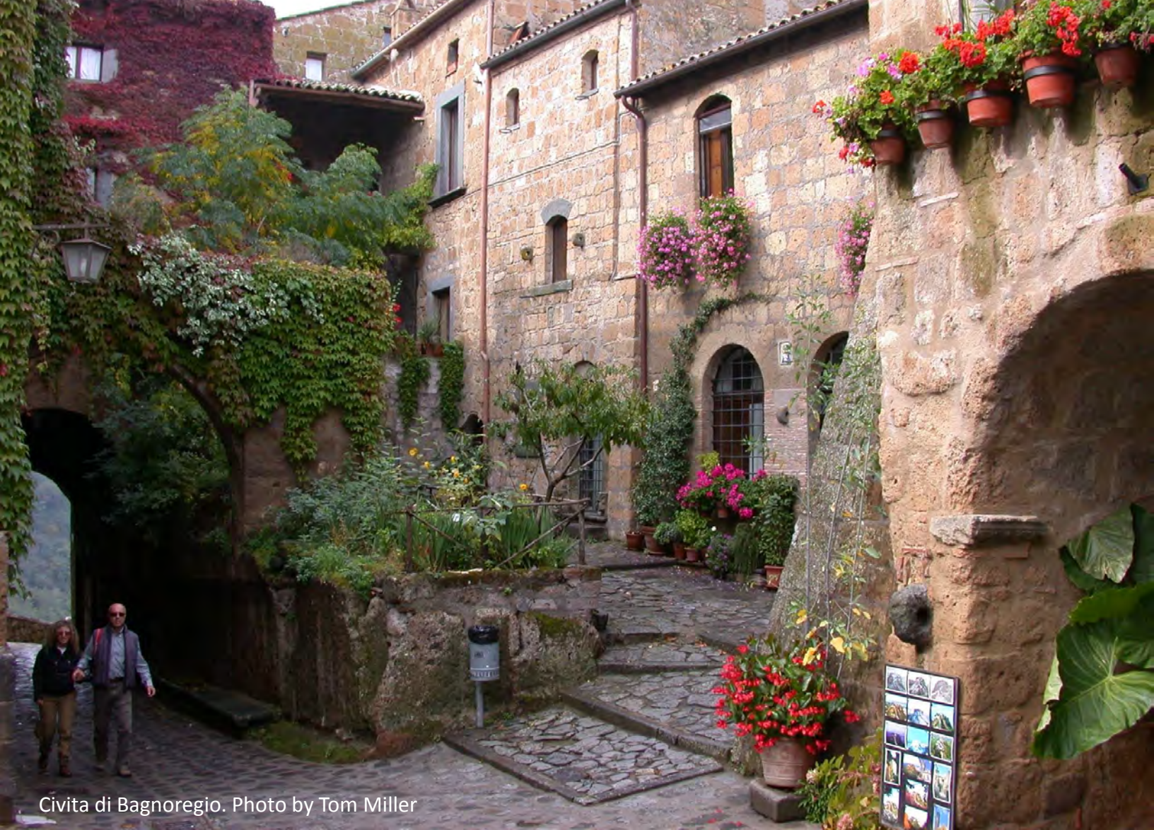
Civita di Bagnoregio.

Your travel guides and compatriots for this remarkable journey: