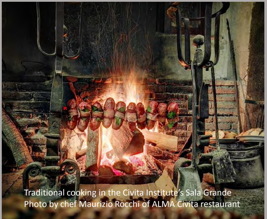
Traditional cooking in the Civita Institute's Sala Grande