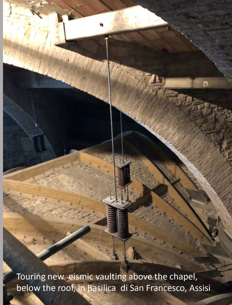
Touring new seismic vaulting above the chapel, below the roof, in Basilica di San Francesco, Assisi