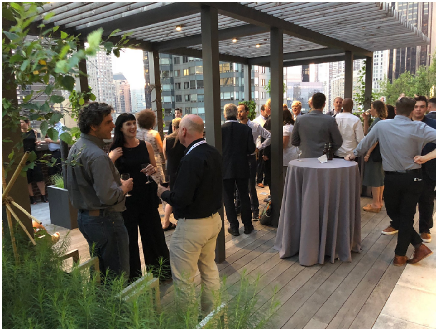
The annual COTE Top Ten Toast was held at COOKFOX Architects in New York City.