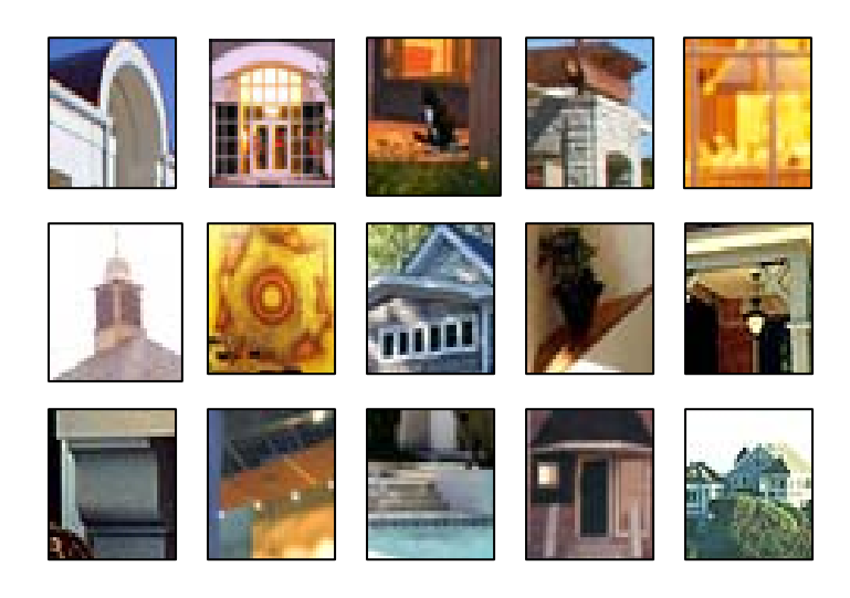
The American Institute of Architects Small Project Practitioners Knowledge Community