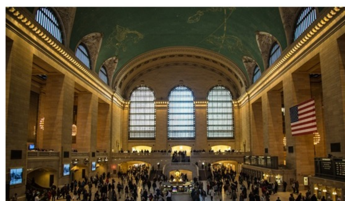
The Beaux-Arts Grand Central Terminal had fallen into disrepair when a consortium, led by Beyer Blinder Belle, began to restore it in 1990.