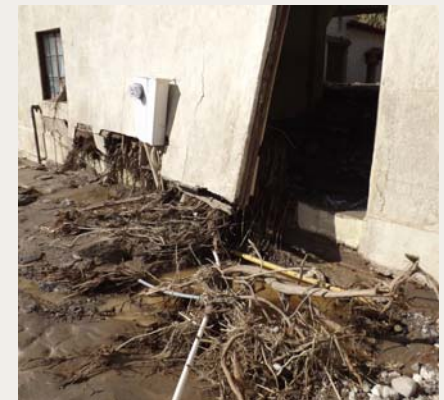
Scotty's Castle Flooding 2015 Death Valley NP