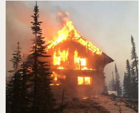
Sperry Chalet Fire, 2017 Glacier NP