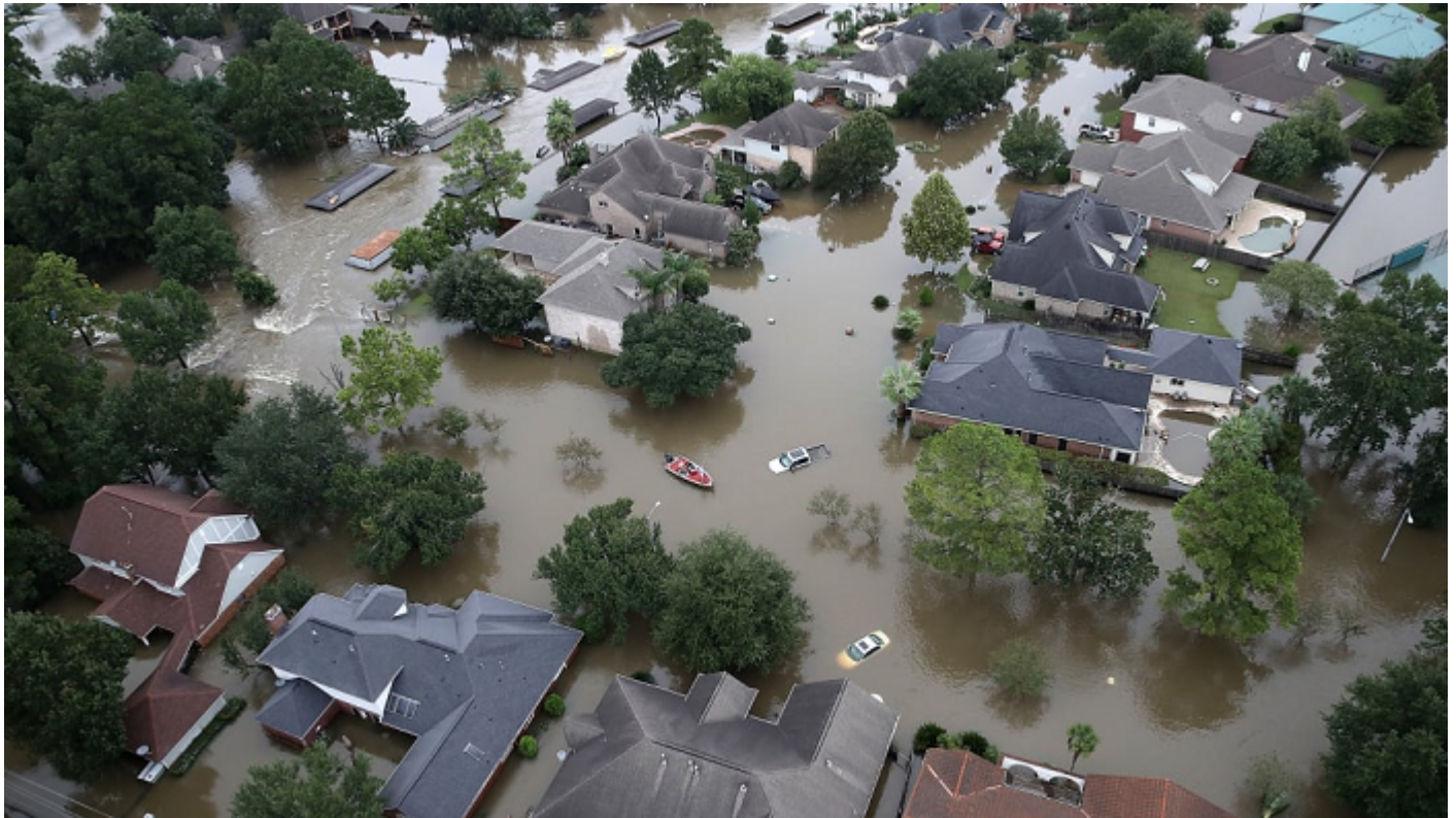
A neighborhood near Lake Houston, where homes and cars were decimated by hurricane flooding.