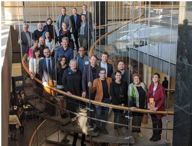
AIA Los Angeles COTE, 2020