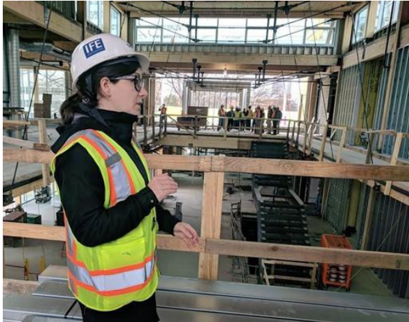
AIA Atlanta COTE, 2019

There are many ways to develop your local COTE presence. There may be one or many catalysts for starting a COTE group within your local AIA Chapter. The steps listed below can be followed in any order and should be considered in the context of your chapter's rules for committees. This is by no means a rigid process. It is likely to be organic, and many aspects will depend on the scale of your Chapter and City as well as local interests.