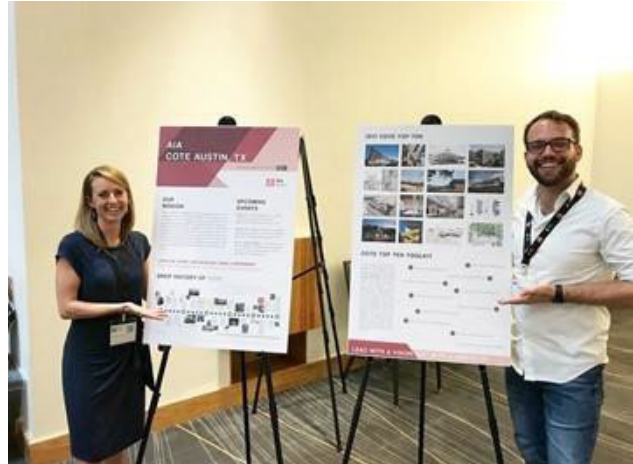
AIA Austin COTE, 2019