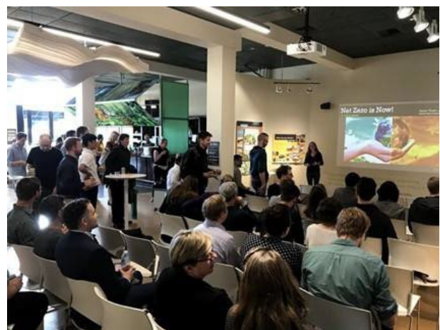
AIA Seattle COTE, 2019