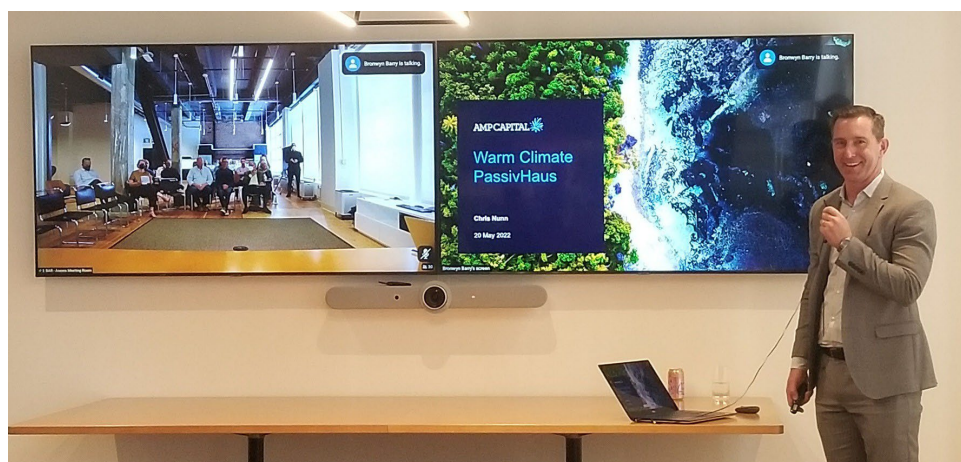
Figure 1. AIA San Francisco COTE hybrid event, 2022

Using your core group as a sounding board, pick a date, time, and place for the first meeting. The two most popular times are during an extended lunch and right after work. If hosting an in-person meeting, common meeting places are the local AIA office (if available), a member architect's office, or a conveniently located library or coffee shop. If hosting a virtual meeting is better for your local chapter, consider using video conferencing software such as Zoom, Teams, or Skype. Check with your local Chapter to see if there is an AIA account you can use. When choosing between in-person and virtual, considering factors such as public health, accessibility, member locations, etc.