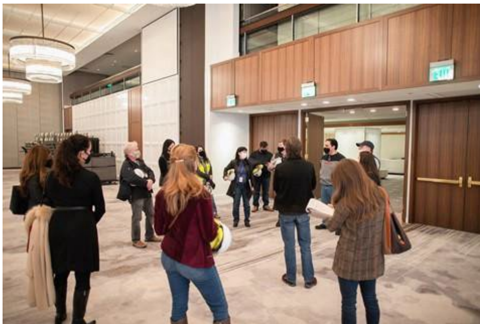
AIA Dallas COTE, 2020

It's important to set the Committee's goals for the year early and plan ahead. The more work you can accomplish up front, the smoother the operation. Many COTE groups start to plan for the following year at the end of the year before, between October to December. Some Chapters may even require this of you, soliciting a work plan for the Committee. You can start setting goals by checking in with your membership at the end of the year. Ask them what they thought went well, what didn't, and what they'd like to learn more about. See the "Maintain Engagement of Members" section below. Don't set too many goals, be reasonable with what you think you can accomplish in one year.