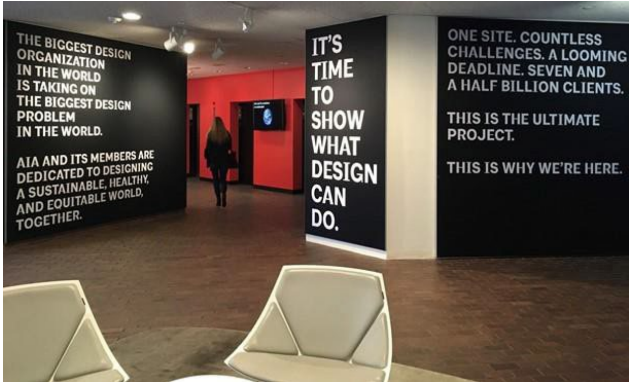
AIA's headquarters in Washington, DC, is alive with the AIA's climate action message, unifying climate response, health, and equity as the central design challenges of our time.

Action Plan ; approving a 2021–2025 AIA Strategic Plan with a priority of “climate action for human and ecological health”; and more.