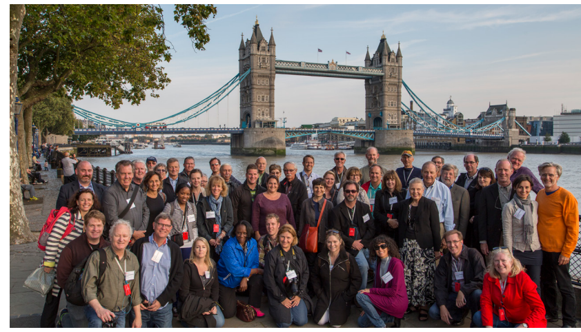
Committee on Design members in London in September 2014