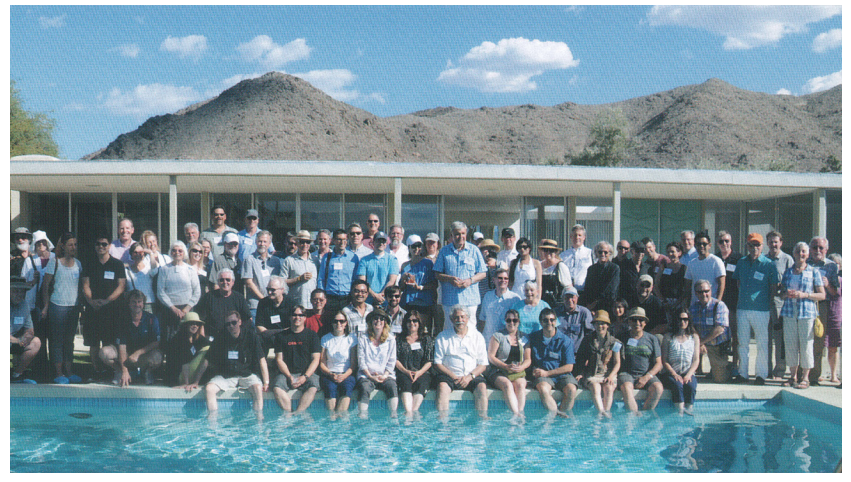
Committee on Design members in Palm Springs, California in May 2013

Your participation with AIA COD will enhance your company's position as a leader in design and construction. We can help you identify trends, hone your message to decision makers, and garner support for your business.