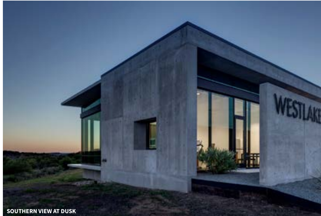
SOUTHERN VIEW AT DUSK