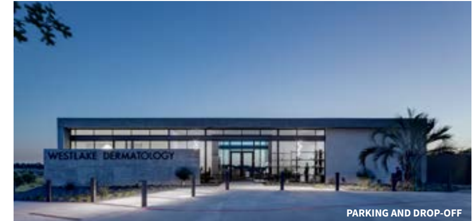
PARKING AND DROP-OFF

Situated to overlook gentle hills to the southwest, the new medical building is intentionally subtle, minimizing the visual presence of the new construction. The nuanced concrete and glass shell merges with the designed landscape architecture, enveloping the comfortable, bright, and open interior in calm and quiet as one transitions from the road, through a garden zone, and into the space overlooking the Texas Hill Country.