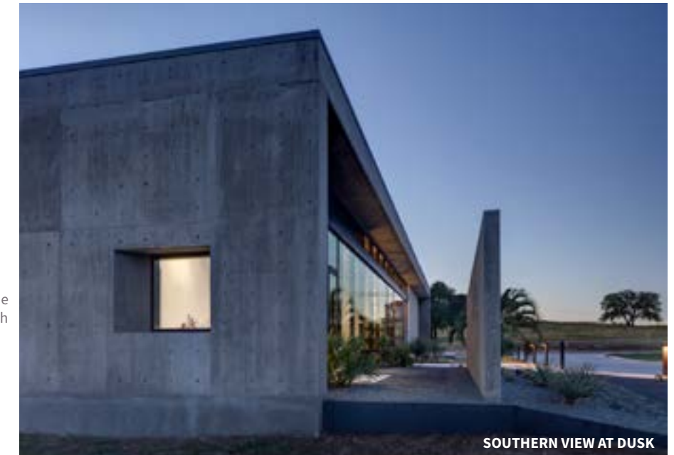
SOUTHERN VIEW AT DUSK