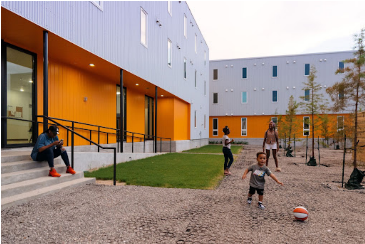
St. Peter Residential, a multi-family project by EskewDumezRipple.