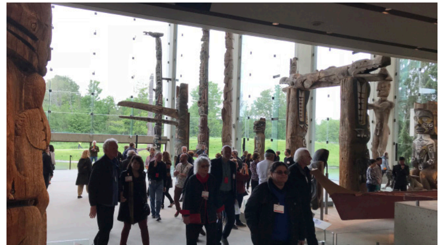
Committee on Design Members in Vancouver, BC in 2018.