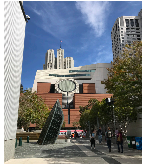
Above: San Francisco Museum of Modern Art

Participants will have the opportunity to see first hand the work of architects that have changed the way we see the world, including Le Corbusier, Herzog & De Meuron, and Peter Zumthor.