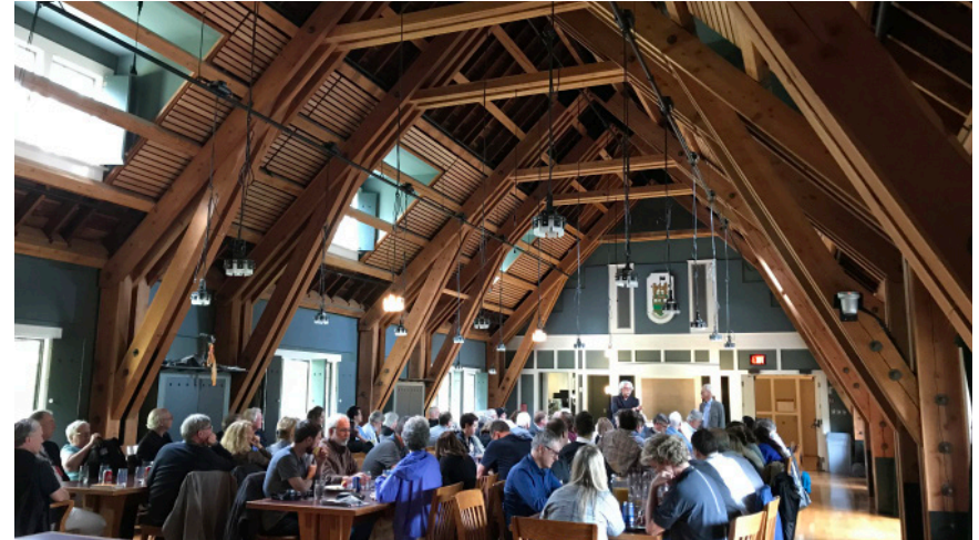
Committee on Design Members in Vancouver, BC in 2018.

Your participation with AIA COD will enhance your company's position as a leader in design and construction. We can help you identify trends, hone your message to decision makers, and garner support for your business.