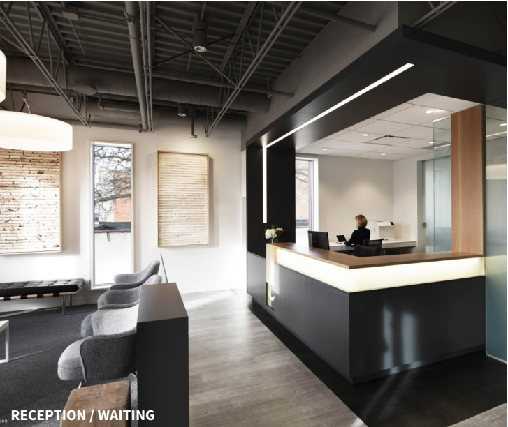
RECEPTION / WAITING

Category C: Renovations/Remodeled: Primarily built within existing hospital or clinical space.