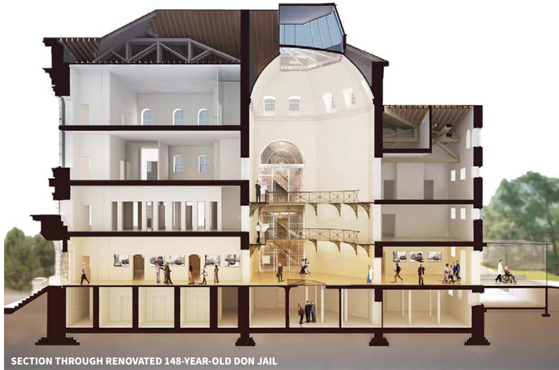
SECTION THROUGH RENOVATED 148-YEAR-OLD DON JAIL