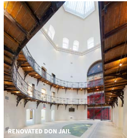
RENOVATED DON JAIL