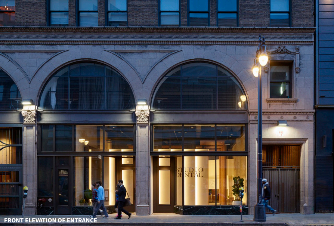
FRONT ELEVATION OF ENTRANCE