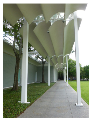
The Menil Collection Wave-shaped "leaves" - exterior canopy

Each year, the Architectural Practice Committee meets face-to-face during the SAME Joint Engineer Training Conference. The conference gives a unique opportunity for the committee members to discuss the committee vision and goals and allows us a chance to gain feedback from the architecture community in a very direct way.