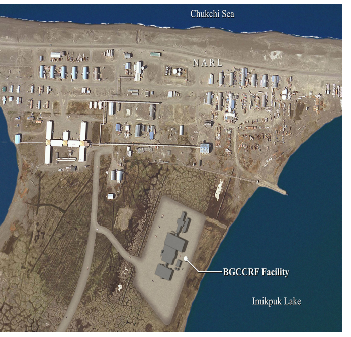
The program provides for a building complex of 88,930 gross square feet (gsf). The design and construction was planned as five phases as described below. Phase II through V have been delayed as a result of funding considerations.

The BGCCRF is located south of the Ukpeagvik Inupiat Corporation (UIC)-Naval Arctic Research Laboratory (NARL) facilities on the shore of Imikpuk Lake, approximately 200 meters from the Arctic Ocean.