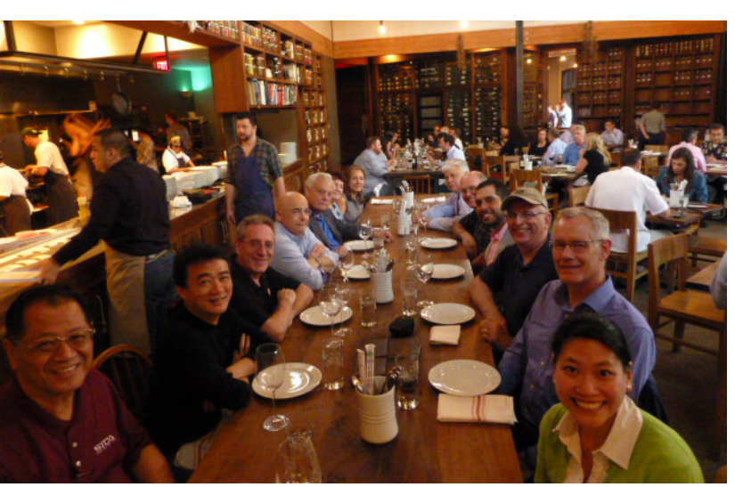
APC members at the Urbahn Medal Award dinner, Underbelly Restaurant, Houston, Texas