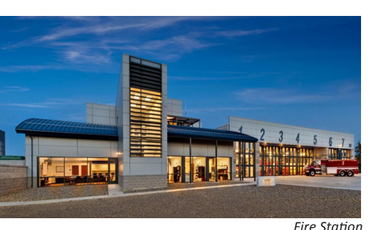
Nevada Air National Guard, Reno, NV