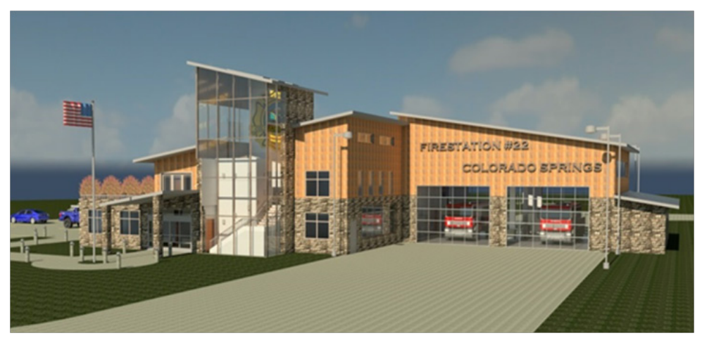
Design by 2nd Lt Taylor Cooksey

complete preliminary designs for the building's site, foundation, structure, electrical and HVAC systems, all in a 3D Revit model. The students must also complete a cost estimate and a LEED version 4 scorecard showing how their project would achieve at least a silver rating. Below are some images from Dr. James Pocock's spring 2015 sections.