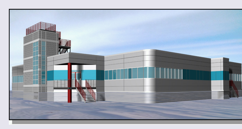
Phase I: Research and Education Facility

The scientific community has expressed significant interest in the new arctic research facility. The opening of the BGCCRF during the International Polar Year's 125th anniversary renewed America's commitment to cutting edge science support in the Arctic. APC