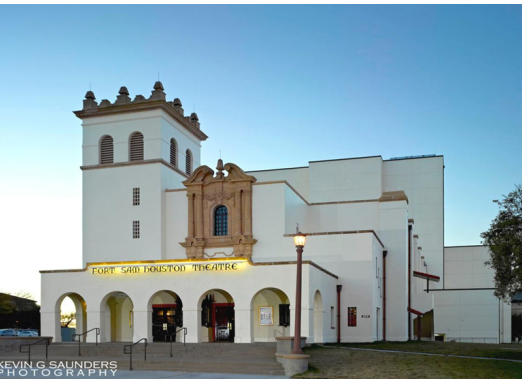
Historic Theater Renovation Joint Base San Antonio, Fort Sam Houston, TX

Since 1976 the Air Force has celebrated and promoted design excellence for its wide-ranging portfolio of built infrastructure through the annual USAF Design Awards Program, and over 500 projects have earned awards since that year. In 2000, the USAF Design Awards Program itself achieved special recognition by winning the Federal Design Achievement Award under the Presidential Design Awards Program. We are proud to announce that in October 2015, we will celebrate the 40th anniversary of this prestigious program by recognizing high quality projects completed by design professionals from around the world.