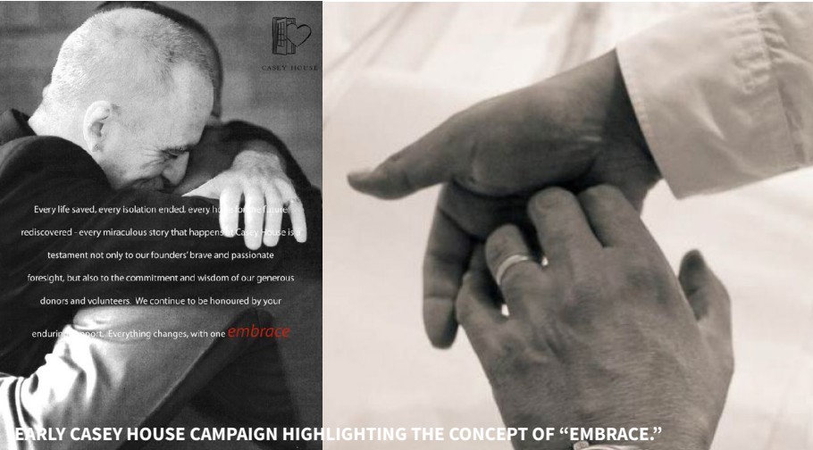
EARLY CASEY HOUSE CAMPAIGN HIGHLIGHTING THE CONCEPT OF “EMBRACE.”

The renovation and extension to Casey House, a specialized healthcare facility for individuals living with HIV/AIDS, develops a new prototype for hospitals . The facility meets the needs of patients and their providers in a setting designed to evoke the experience and comforts of home. With the fundamental goal of creating a comfortable, home-like user experience , the embrace emerged as a unifying theme—one of warmth, intimacy, comfort, privacy, connectivity, and solidity . Referring to the goals of Casey House, it also describes the design of the architectural form, the user experience, and the atmosphere in the building itself.