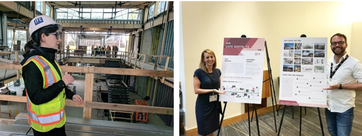
AIA Atlanta COTE, 2019

There are many ways to develop your local COTE presence. There may be one or many catalysts for starting a COTE group within your local AIA Chapter. The steps listed below can be followed in any order and should be considered in the context of your chapter's rules for committees. This is by no means a rigid process. It is likely to be organic, and many aspects will depend on the scale of your Chapter and City as well as local interests.