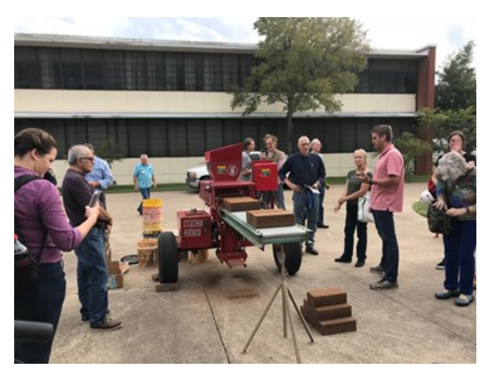
Figure 1 AIA San Antonio COTE, 2019 (c: Kendall Claus)

Using your core group as a sounding board, pick a date, time, and place for the first meeting. The two most popular times are during an extended lunch and right after work. If hosting an in-person meeting, common meeting places are the local AIA office (if available), a member architect's office, or a conveniently located library or coffee shop. If hosting a virtual meeting is better for your local chapter, consider using video conferencing software such as Zoom, Teams, or Skype. Check with your local Chapter to see if there is an AIA account you can use. When choosing between in-person and virtual, considering factors such as public health, accessibility, member locations, etc.