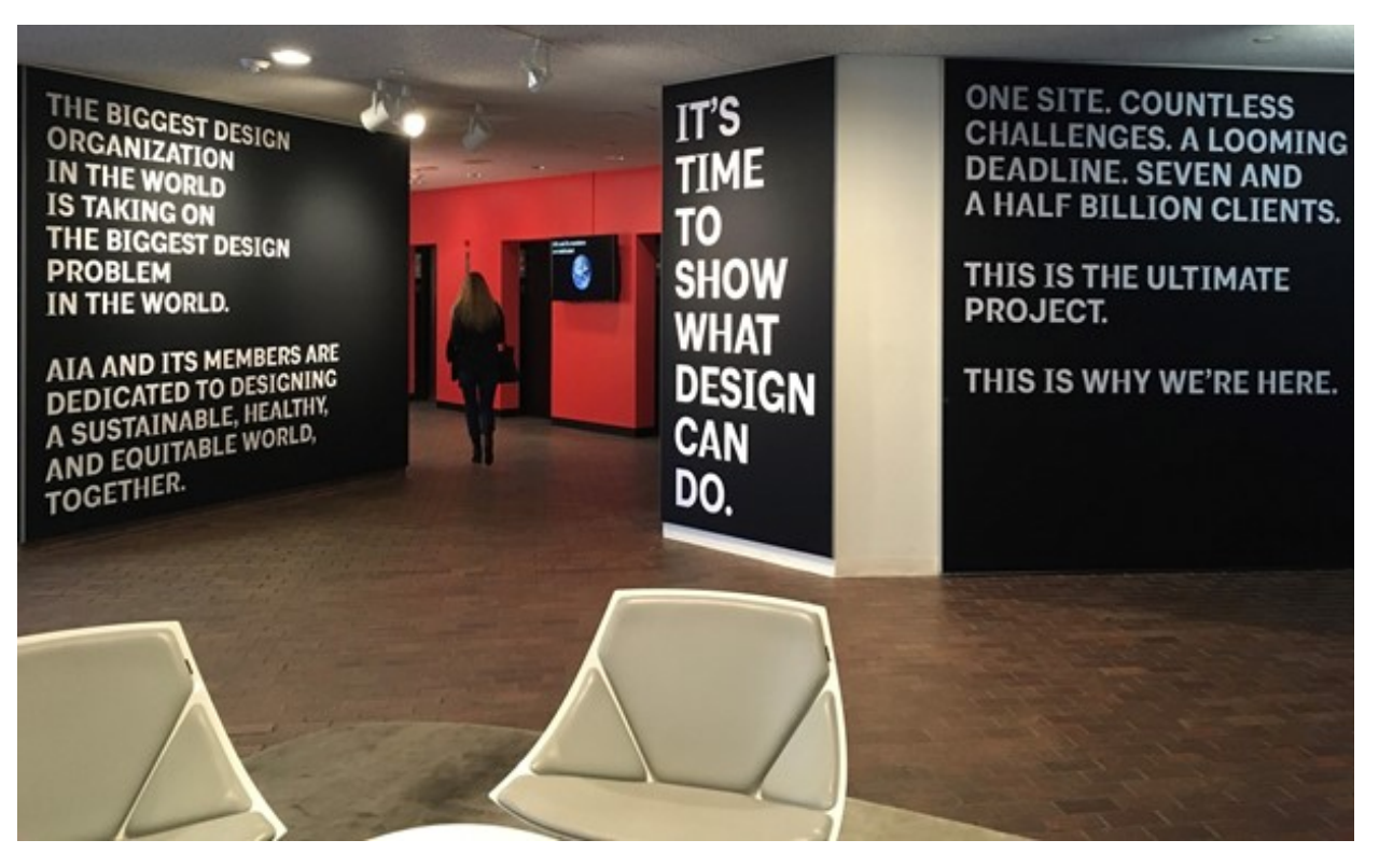
AIA's headquarters in Washington, DC, is alive with the AIA's climate action message, unifying climate response, health, and equity as the central design challenges of our time.