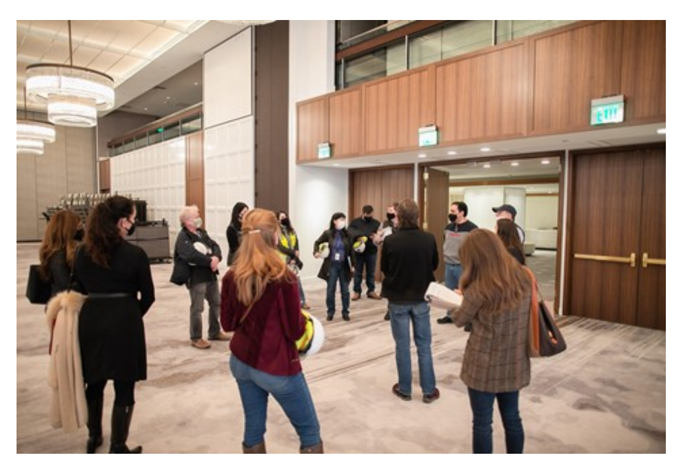
AIA Dallas COTE, 2020

It's important to set the Committee's goals for the year early and plan ahead. The more work you can accomplish up front, the smoother the operation. Many COTE groups start to plan for the following year at the end of the year before, between October to December. Some Chapters may even require this of you, soliciting a work plan for the Committee. You can start setting goals by checking in with your membership at the end of the year. Ask them what they thought went well, what didn't, and what they'd like to learn more about. See the "Maintain Engagement of Members" section below. Don't set too many goals, be reasonable with what you think you can accomplish in one year.