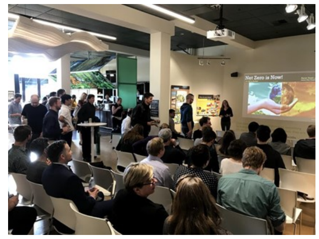
AIA Seattle COTE, 2019