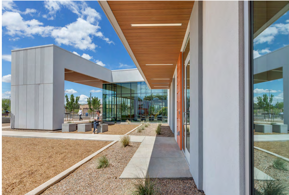
EXTERIOR SEATING SPACE