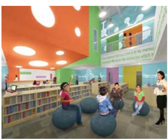
DoDEA Elementary School Learning Centers

This course did an excellent job of presenting core concepts of DoDEA's 21st Century Education, how facility design responds to those ideas, the Design Center approach to shared creativity and standardization, and how the school facility is actually used for education and enrichment of students. The entire slide deck and a recorded presentation are available at <a href="mailto:same.org/apc">same.org/apc</a>.