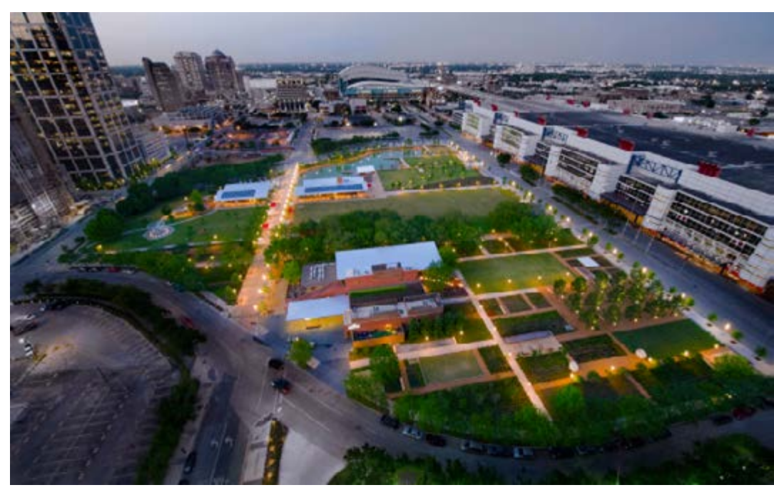
Discovery Green downtown Park adjacent to the George R. Brown Convention Center (left)

"Mystree" and playground, Solar photovoltaic and water heating collectors, Administration building with real time energy display, Interactive fountain and pump room, Lakehouse with library and green room uses, Amphitheater as garage cover, Le Phantom by Jean Dubuffet, Garage lobby and vehicle ramp. The tour will focus on design effectiveness and system integration. Plan for at least 45 minutes for the walking portion of the tour, until 12:30, but Page can make it an hour or longer if that time is available in the conference agenda. The presentation and tour is available for AIA CEU credit and we'll have appropriate paperwork for those interested in getting Continuing Education credit.