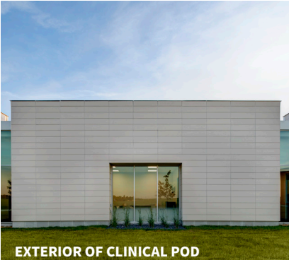
EXTERIOR OF CLINICAL POD