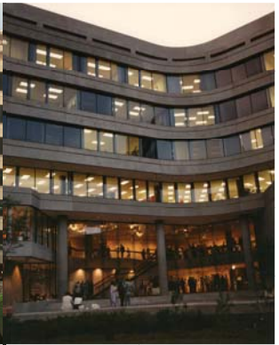
AIA Headquarters The Architect's Collaborative