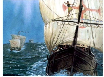
Searching for Definitions of Architectural Design Excellence in a Measuring World