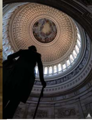
Capitol of the United States of America Many Architects