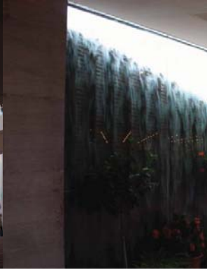
East Wing of the National Gallery of Art I. M. Pei