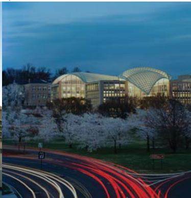
U.S. Institute for Peace Headquarters Moshe Safdie