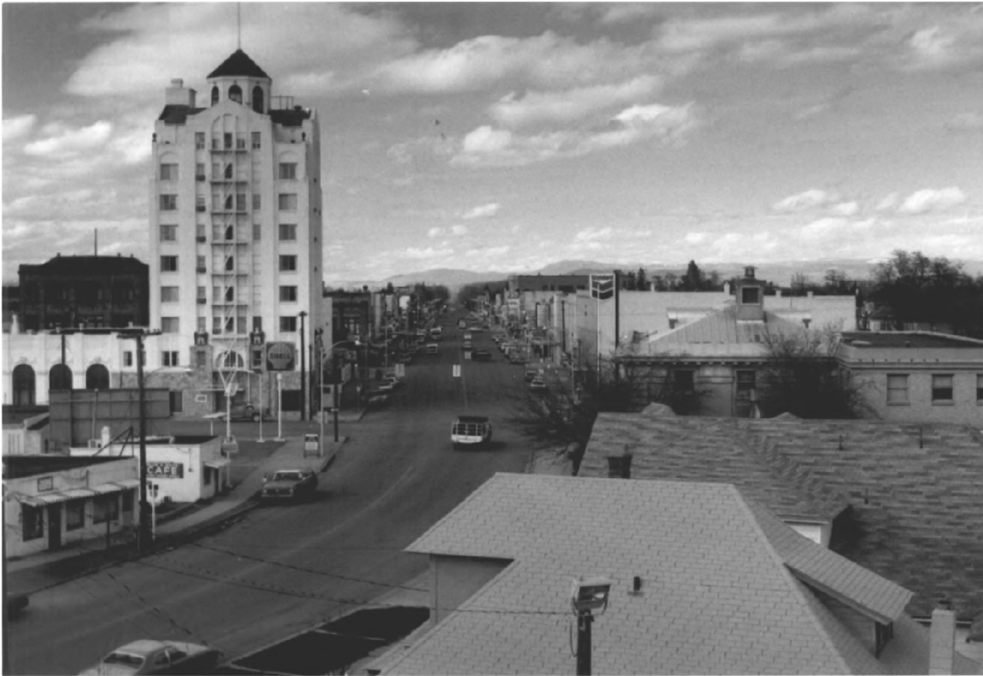
Baker Historic District Baker, Baker County, Oregon 1 of 30 JUL 18 1978

What happened? The Baker City Historic District, 42 years later. Baker City, Oregon