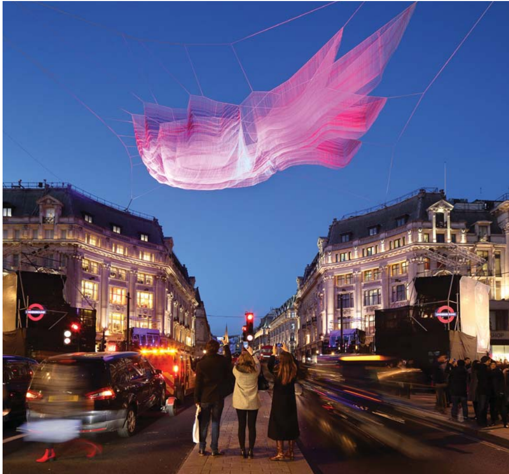
Janet Echelman's sculpture '1.8' refers to the length of time in microseconds that the earth's day was shortened as a result of the 2011 earthquake and tsunami that emanated from Japan. The work is composed of layers of fiber, braided and knotted together in vibrant hues that pulse with changing wind and weather to create a choreography of undulating color.

The National Park Service (NPS), the National Capital Planning Commission (NCPC), and Van Alen Institute are collaborating on Memorials for the Future , an ideas competition to reimagine how we think about, feel, and experience memorials.