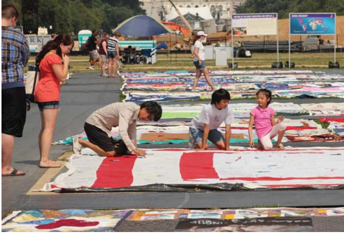
The AIDS Memorial Quilt is made up of more than 48,000 panels dedicated to at least 94,000 individuals lost to the AIDS pandemic. The NAMES Project displays sections of The Quilt at thousands of sites nationwide every year.

Jurors will help select finalist teams and winning teams. They will also provide feedback during the design framework working session (in Phase II) and the final presentation (in Phase III).