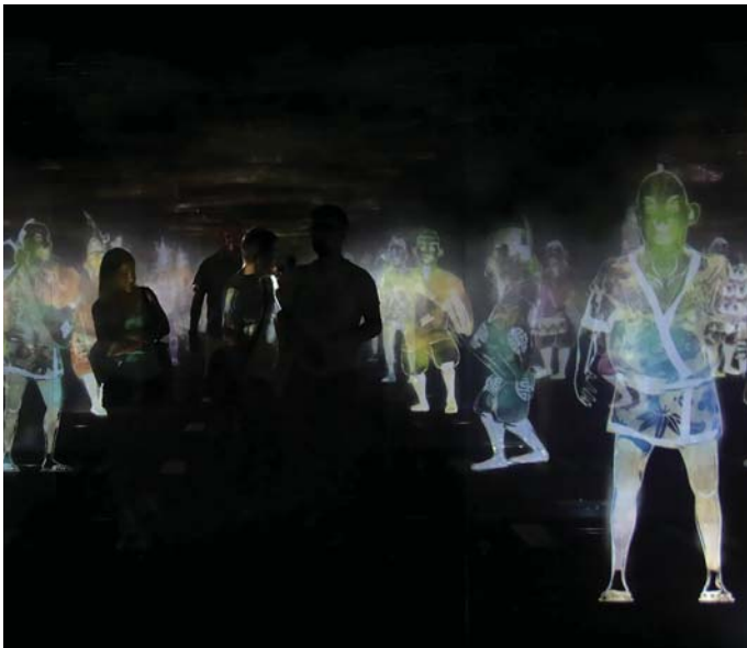
'Peace Can Be Realized Even Without Order' is an interactive digital installation by teamLab. The installation commemorates the peace that is gradually restored with time after conflict. Holographic figures play instruments and dance, affected by the sounds coming from neighboring holograms. When a visitor moves toward the installation, the figures respond by pausing their performance.

As a national capital, Washington is a place of collective memory. The wealth of monuments sited throughout the city take on heightened significance as they reflect relationships among nations, of national remembrance, and of many important events and figures in our history. Often the traditional and fixed nature of memorial design does not allow for adaptation and redefinition over time, or encourage more than one interpretation of a given narrative.