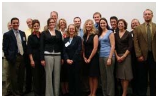
Representatives of the student teams attending the 2007 Peterson Prize award presentation

The Historic American Buildings Survey (HABS) of the National Park Service, The Athenaeum of Philadelphia, and the AIA have announced the 2007 winners of the Charles E. Peterson Prize, which annually recognizes the best set of measured drawings prepared to HABS standards and donated to HABS by students. Taking first place was a team of 18 students from the School of Architecture & Environmental Design at Kent State University. The students prepared a set of drawings for the W. Arms Museum in Youngstown, Ohio. For details about the ceremony, see the article. For more details on the winners and the winning drawings, see the Charles E. Peterson Prize Web site .