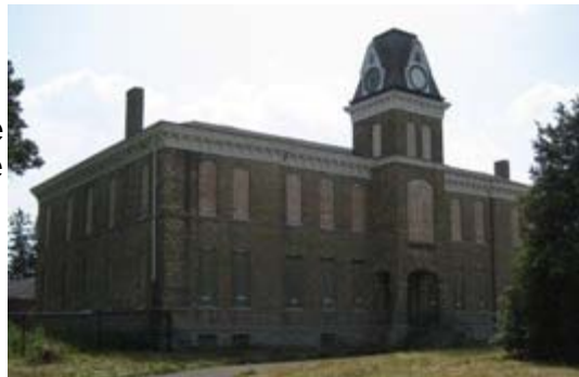
Building 67 (headquarters), Department of the Dakotas, Fort Snelling

The federal government then deeded the entire Upper Post, consisting of 142 acres and 28 buildings (including Building 67), to the State of