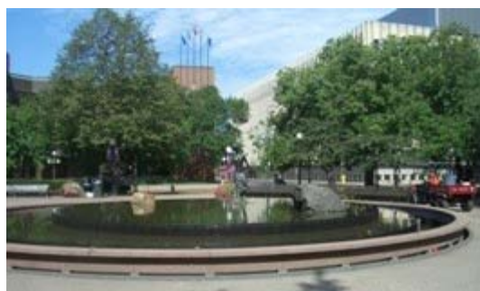
Rice Park is among the oldest dedicated public squares in America.