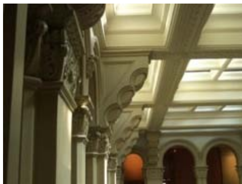
Interior detail, Landmark Center

During the field session, participants inventoried and evaluated the central organizing and character-defining features of Rice Park. They attempted to locate and identify any significant remaining features of the plan and landscape that might still possibly possess historic integrity. The venue for the lecture and classroom portions of the field session was notable in its own right—the elegantly restored historic Courtroom 326 in the beautiful Landmark Center adjacent to the park.