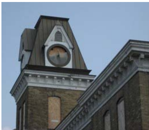
Detail of the Building 67 clock tower (1883)

The field session used study materials the HRC developed to introduce attendees to the process of assessing the integrity and material condition of a historically significant building originally developed by the National Park Service. During the field session, participants were introduced to the basic principles of conducting an historic building assessment and sent out into the field to identify the significant architectural character-defining features of Building 67.