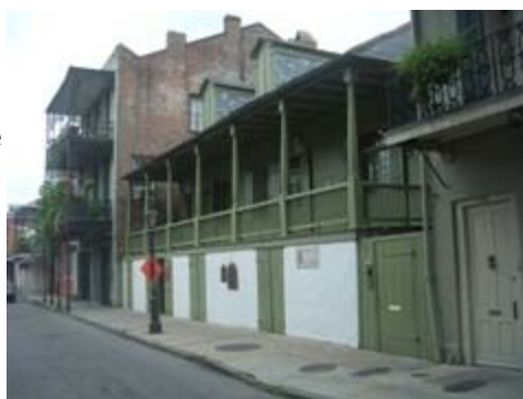
Madame John's Legacy, New Orleans