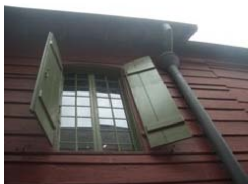
Window detail, Madame John's Legacy

The study materials assembled and distributed for use during an AIA HRC Historic Building Assessment workshop usually include of reprints of articles and essays, some of which originally appeared in early volumes of the Old House Journal , published by Restore Media. It seems fitting that, finally, AIA HRC could present the Historic Building Assessment workshop during a conference hosted by Restore Media. Restore Media have been long-time sponsors of AIA HRC activities.