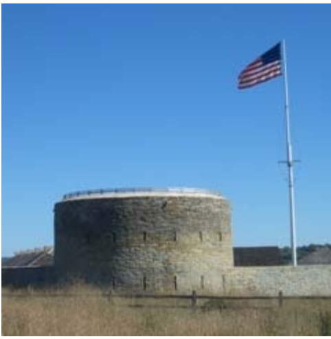
Fort Snelling National Historic Landmark

1883, and the department headquarters returned to St. Paul in 1886. After that point, Building 67 served as post headquarters until the fort closed in 1946. A fire broke out in the building in 1916.