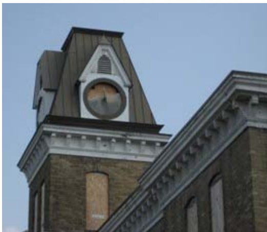
Detail of clock tower, Building 67, at Fort Snelling National Historic Landmark