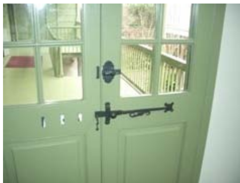
Interior door detail

its fine architectural character, it has been designated as an official National Historic Landmark. The architectural complex at Madame John's actually consists of three buildings: the main house, the kitchen with cook's quarters, and the two-story garconniere.