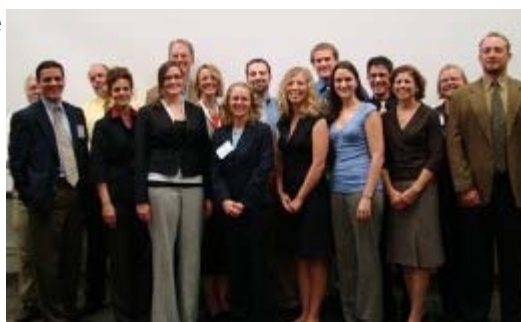
Representatives of the winning student teams who attended the 2007 Peterson Prize presentations at Tulane University