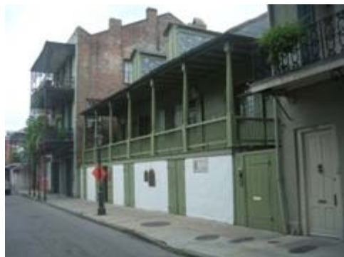
Madame John's Legacy in the French Quarter, New Orleans