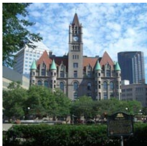
Rice Park, St. Paul, with Landmark Center in the background

The park was redesigned in 1898 to complement the new federal court building (Landmark Center). The period corresponds with the national "City Beautiful" movement and represents an important phase in civic improvement in St. Paul.